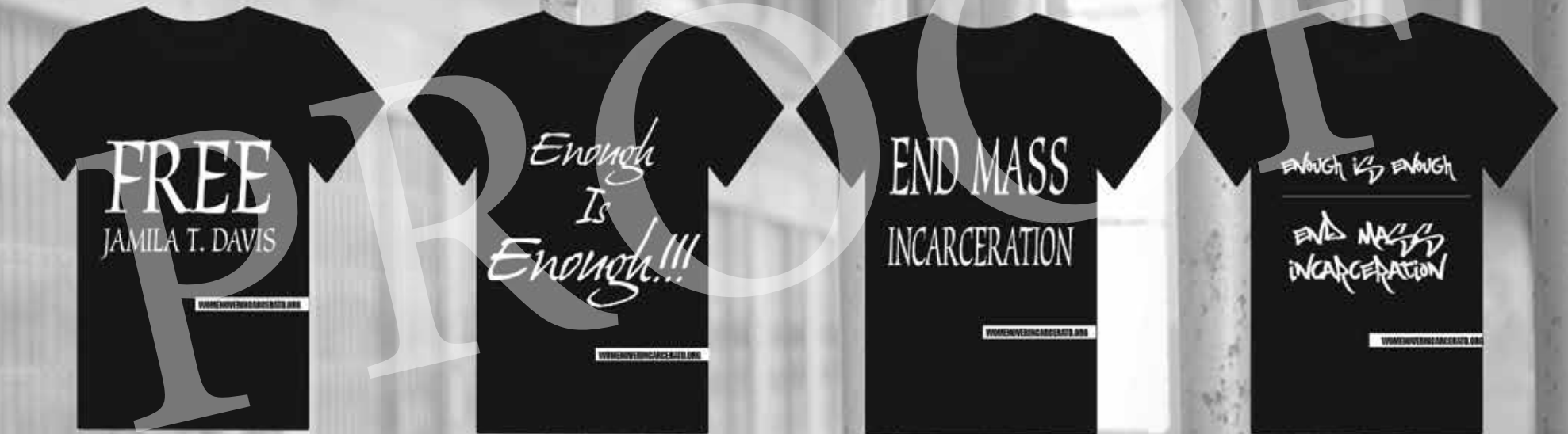
Shirt #1 Customized T-Shirt w/Inmate Name