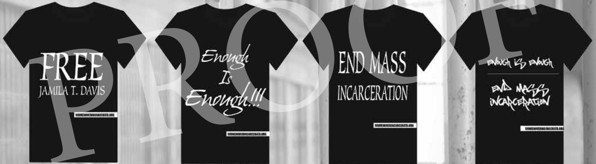
Shirt #1 Customized T-Shirt w/Inmate Name